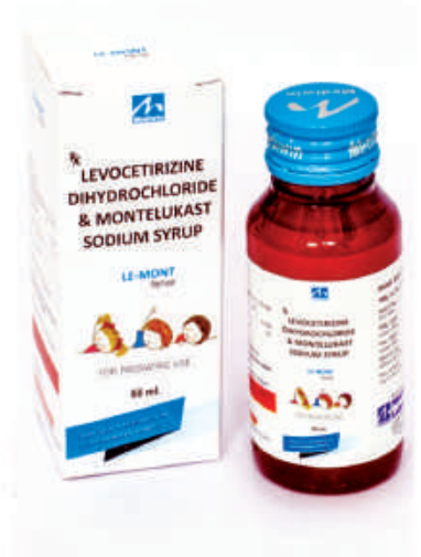
Quality of life in Persistent Allergic Rhinitis

FDA approved drug for seasonal & perennial allergic rhinitis & uncomplicated skin manifestations of chronic idiopathic urticaria