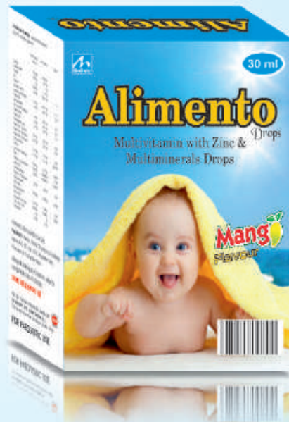
Nutritional Information (approximate values) Each ml. contains (approx.)